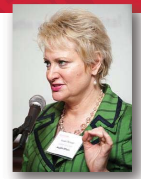
Watch the full presentation at <a href="http://business.rutgers.edu/lerner">http://business.rutgers.edu/lerner</a> then click on Healthcare Symposium 2012

Some of the challenges that Biopharma is currently facing include increasing efficiency and productivity of R&D pipeline and demonstrating value to payers, especially for high-cost cancer drugs that extend life of patients for a few months. In order to decrease the total cost of drugs for patients, Accountable Care Organizations (ACOs) may work directly with pharmaceutical companies. There